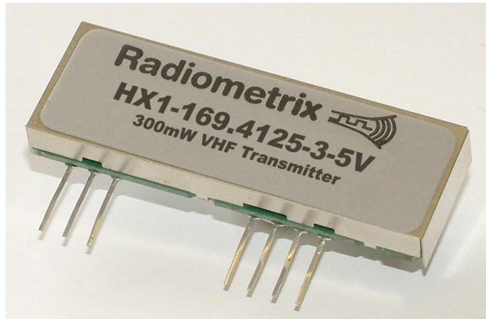
Figure 1: HX1-169.4125-3-5V

The special HX1 transmitter modules offer a 300mW RF output VHF data link in Radiometrix SIL standard pin-out and footprint. This makes the HX1 ideally suited to those low power applications where existing narrow band and wideband transmitters provide insufficient range. Together with the matching RX1 or BiM1R receiver a one-way radio data link can be achieved over a distance up to 10km+ with suitable choice of data rate and antennas.